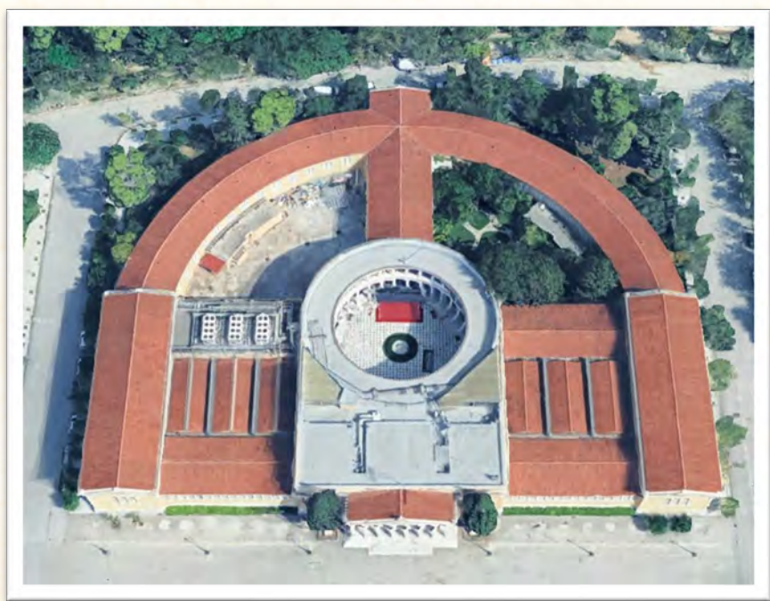
Zappeion Virtual Tour

The Exhibition Area is conveniently located adjacent to all congress halls